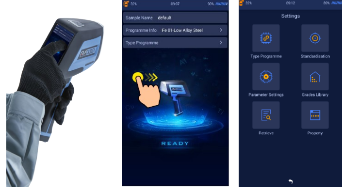
Figure 2: Illustrating (on the left) Changing the settings with 1 swipe.

The universal curve function makes it easy to just pick up and start testing straight away.