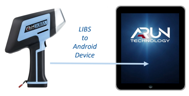
Figure 7: Data transfer between LIBS and Android device

The smart phone and tablet interactive interface makes the CALIBUS more convenient to use. It has a 5-inch colour, high resolution touch screen that is protected with a super impact-resistant glass material.