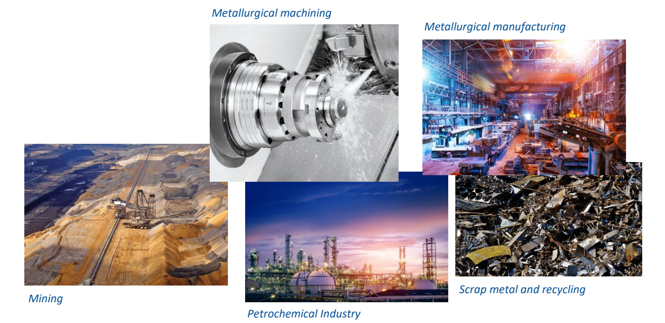
Figure 1: Examples of where the CALIBUS has been used.

The new CALIBUS is an ideal analytical solution for QA/QC, metallurgical manufacturing and machining, petrochemical industries, mining, scrap metal and recycling (figure 1).